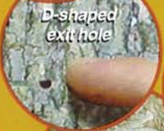
D-shaped exit hole