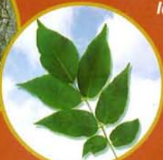
Ash tree leaf