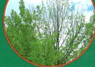
Die-back of tree canopy

It is vitally important that you cooperate with the state to help limit the spread of this destructive ash tree pest.