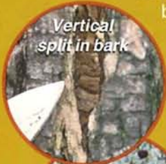
Vertical split in bark

vertical splits to occur in the bark. Distinct S-shaped larval feeding tunnels may also be apparent under the bark.