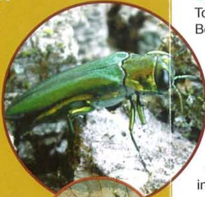
Adult Emerald Ash Borer

Emerald Ash Borer adults are dark metallic green in color, 1/2-inch in length and 1/16-inch wide. They are only present from late May to late July. Larvae are creamy white in color and are found under the bark. Their appearance typically goes undetected until trees show symptoms of being infested.